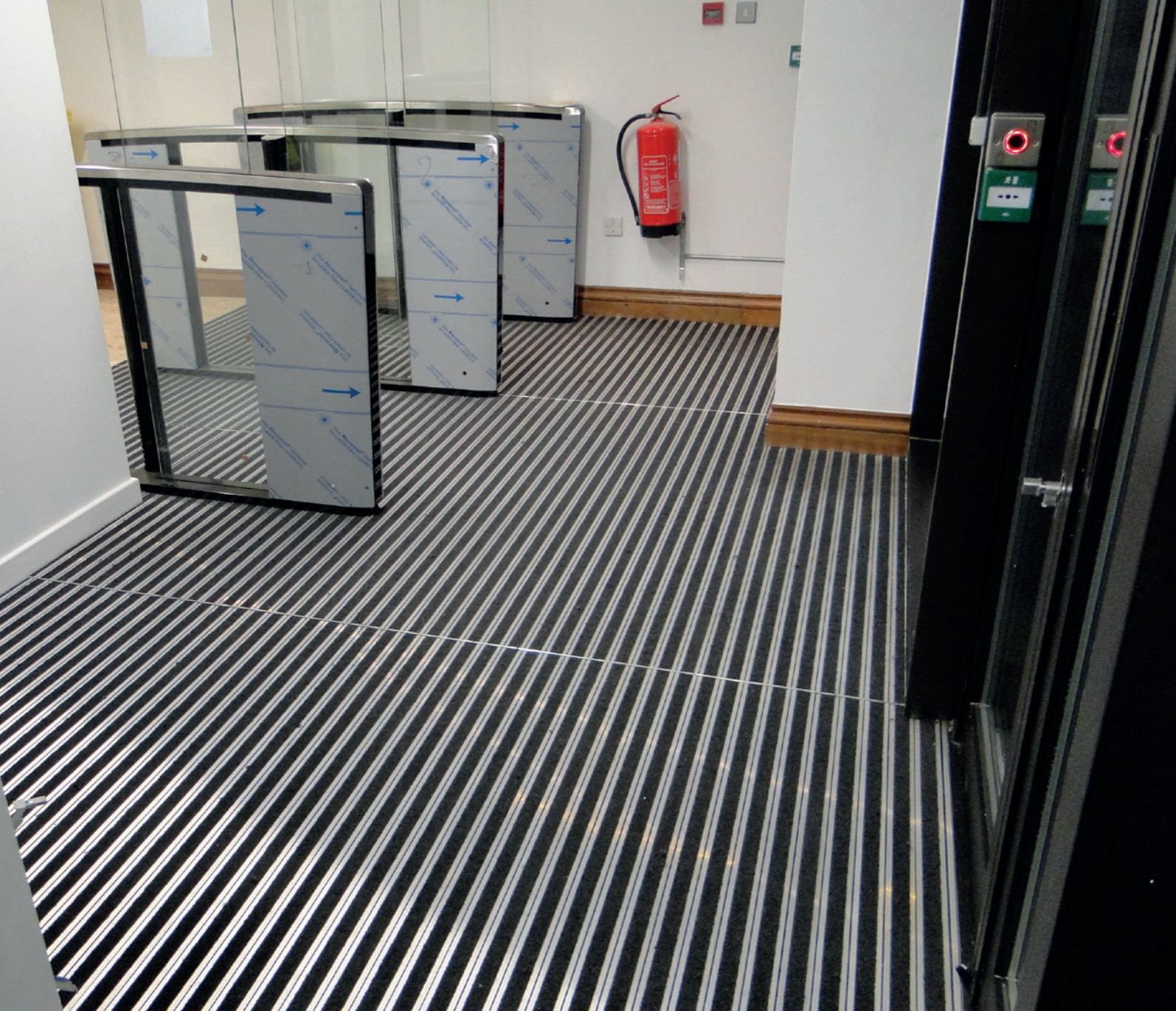
12mm frameworks, Workspace Entrance Vulcan