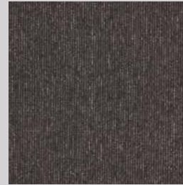
Jet / Quartz, 821101 (LRV - 3.82)