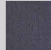
Aegean / Sapphire, 831501 (LRV - 6.75)